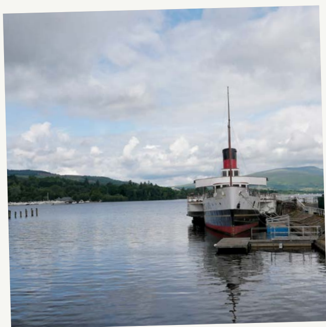
The Maid of the Loch