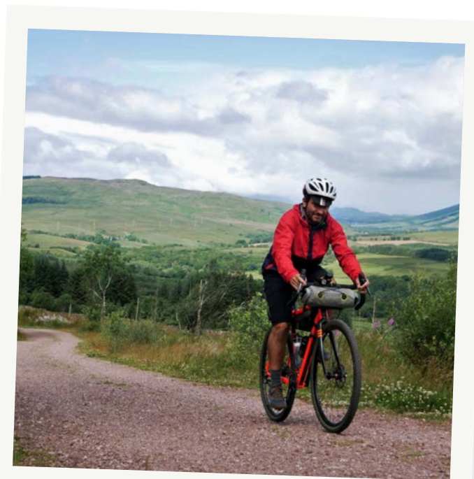
Gouk Hill climb

Take care through the woods where there are some steep steps and give way to walkers on the descent to Balloch. The Maid of the Loch steamship on Loch Lomond is your turning point. The return journey follows the much easier tarmac cycle route back to Helensburgh.