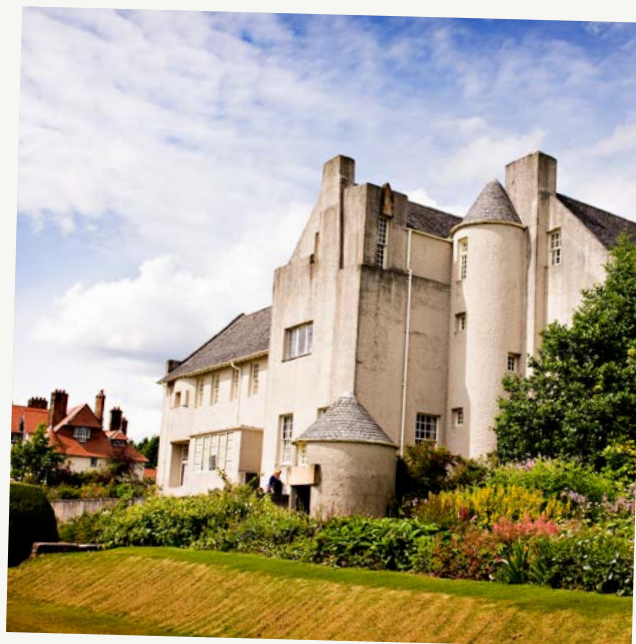
The Hill House